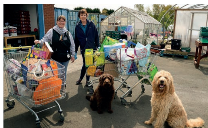
The Bay Foodbank