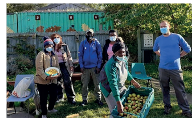
West End Refugee Service