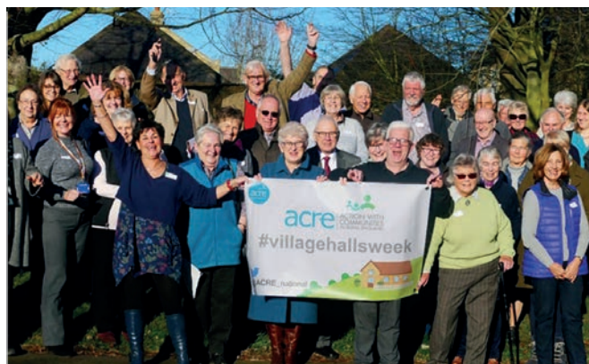
Community Action Northumberland