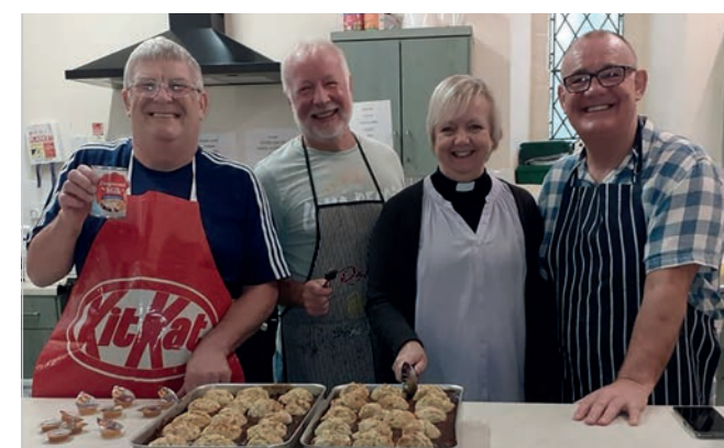
St. Paul's Community Partnership