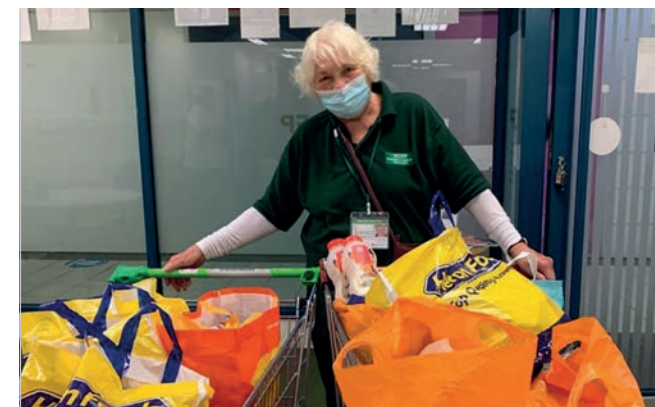
Washington Community Food Project