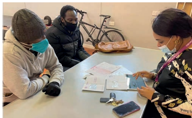
Sunderland Bangladesh International Centre